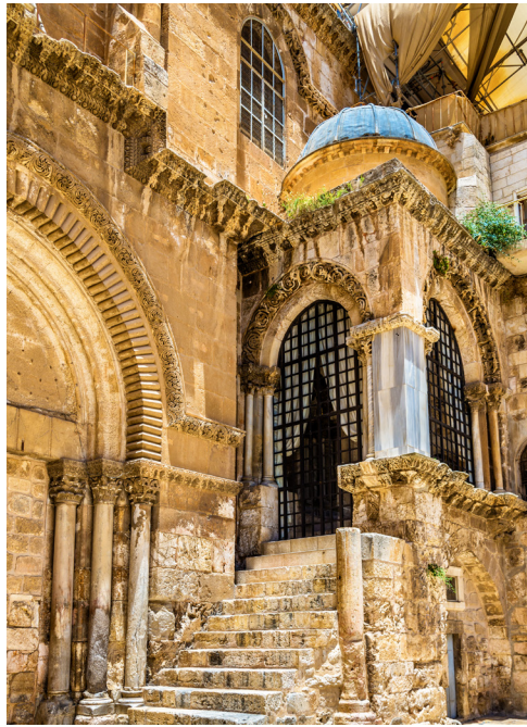
Church of the Holy Sepulchre