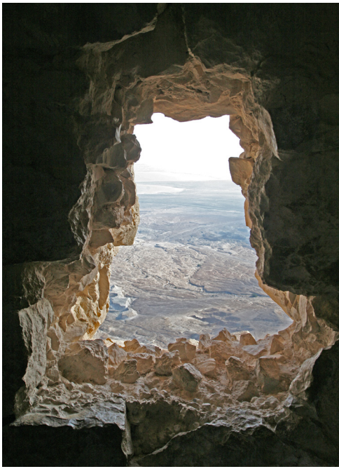
Dead Sea view from Masada